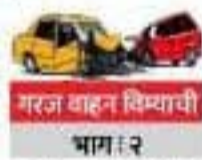
गर्ज वाहन विम्याची भागाः २

छत्रपती संभाजीनगर, १४ : (१) - वाहनधारकांना 'भुलभुलैय्या' होण्याची शक्यता आहे. (२) - वाहनधारकांना 'भुलभुलैय्या' होण्याची शक्यता आहे.