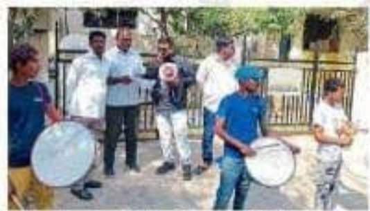
छत्रपती संभाजीनगर शासकीय शाळांमध्ये शिवचरित्र पारायण सप्ताहाची सुरवात झाली.

छत्रपती संभाजीनगर, १४ : (१) - कर्मचाऱ्यास शिवीगाळ, एकावर गुन्हा दाखल झाला. (२) - कर्मचाऱ्यास शिवीगाळ, एकावर गुन्हा दाखल झाला.