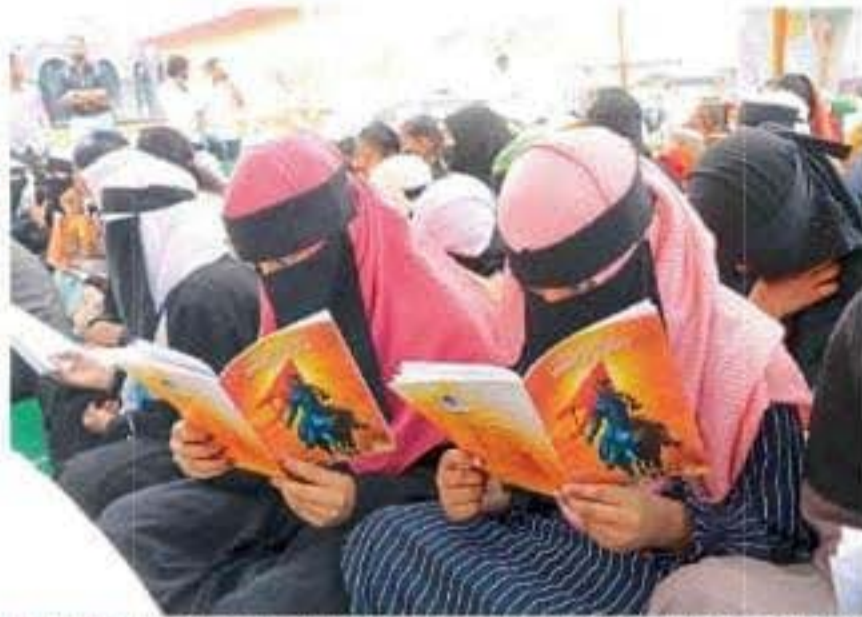
छत्रपती संभाजीनगर शासकीय शाळांमध्ये शिवचरित्र पारायण सप्ताहाची सुरवात झाली. (२) - छत्रपती संभाजीनगर शासकीय शाळांमध्ये शिवचरित्र पारायण सप्ताहाची सुरवात झाली.

छत्रपती संभाजीनगर शासकीय शाळांमध्ये शिवचरित्र पारायण सप्ताहाची सुरवात झाली. (२) - छत्रपती संभाजीनगर शासकीय शाळांमध्ये शिवचरित्र पारायण सप्ताहाची सुरवात झाली. (३) - छत्रपती संभाजीनगर शासकीय शाळांमध्ये शिवचरित्र पारायण सप्ताहाची सुरवात झाली.